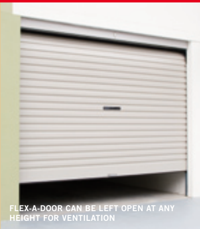
FLEX-A-DOOR CAN BE LEFT OPEN AT ANY HEIGHT FOR VENTILATION