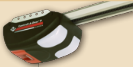
CONTROLL-A-DOOR P DIAMOND WQ – WHISPER QUIET