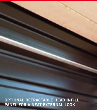
OPTIONAL RETRACTABLE HEAD INFILL PANEL FOR A NEAT EXTERNAL LOOK

thanks to Flex-A-Door's enclosed springs, and no moving brackets or door supports.