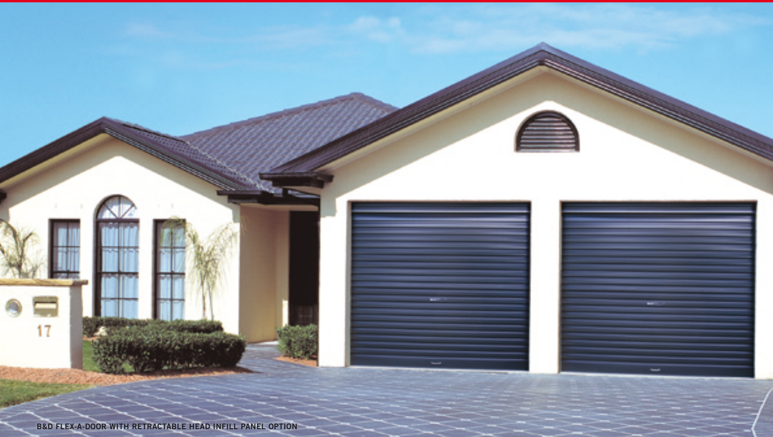
B&D FLEX-A-DOOR WITH RETRACTABLE HEAD INFILL PANEL OPTION