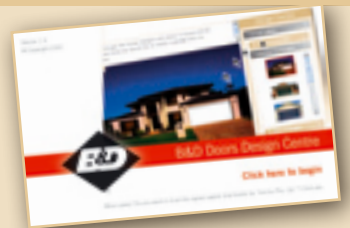
SEE YOUR HOUSE WITH A B&D FLEX-A-DOOR