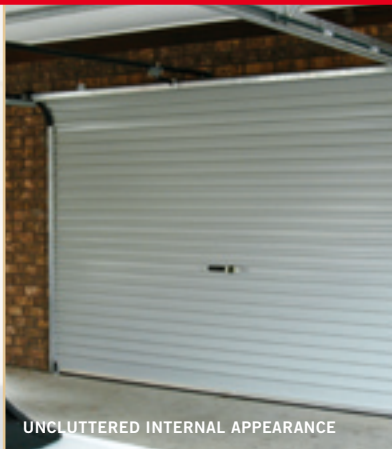
UNCLUTTERED INTERNAL APPEARANCE