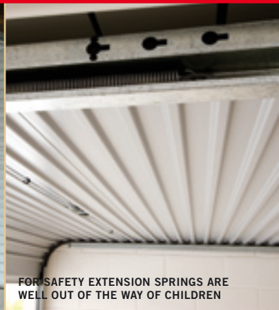
FOR SAFETY EXTENSION SPRINGS ARE WELL OUT OF THE WAY OF CHILDREN